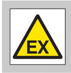
Figure 7-1 Ex Warning Sign