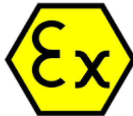
Figure 7-2 Ex Warning Symbol